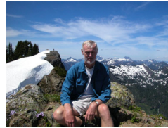
The secretary on Sabbatical

The bottom line is that this will be a workable system which should result in some system improvements in many of our units however there is a resource implication of all of the changes in the form of document control and quality assurance. Impact studies are ongoing as to what the implications of all of this for us will be and will be a required part of the finalization phase.