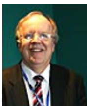
The Vice president

All members are encouraged to rally their colleagues (and especially employees) in the field to join this Society.