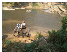
The president at a meeting

and the composition of symposia and oral proffered paper sessions.